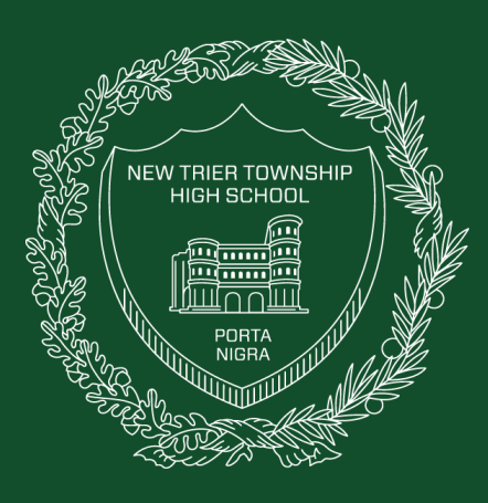
To commit minds to inquiry, hearts to compassion, and lives to the service of humanity<sup>®</sup>

School Code: 144430 Printed October 2024: Department of Communications and Alumni Relations