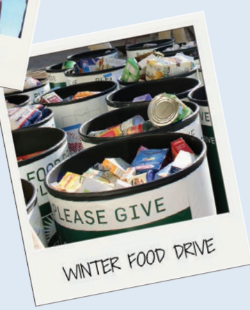
WINTER FOOD DRIVE