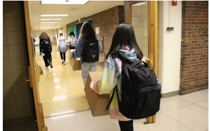
Freshman adviser rooms carry donated gifts and food items for families in need during the holiday season as part of New Trier's annual partnership with Northwestern University Settlement House (NUSH).

Social Service Board oversees more than 15 groups that serve organizations across the Chicago area, from tutoring younger kids to working with adult Special Olympians.