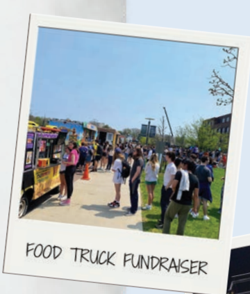
FOOD TRUCK FUNDRAISER