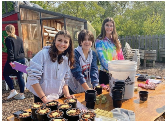
Adviser rooms and classes sometimes participate in group service projects, such as volunteering at the Glencoe Community Garden.