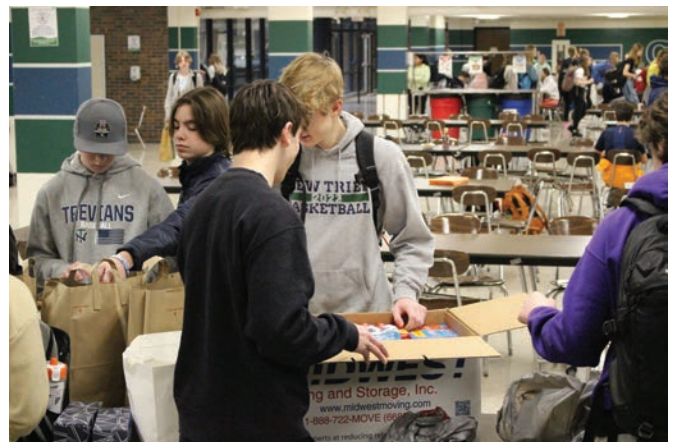
Northfield Pep Club often organizes an annual toiletry drive for Chicago-area organizations such as the Northfield Food Pantry and Hines Veteran Hospital.