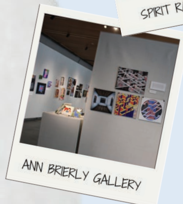
ANN BRIERLY GALLERY