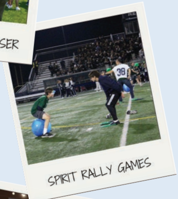
SPRIT RALLY GAMES