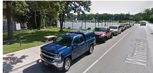
Location of the Winnetka Bowling Shuttle – Hang by the Bench!